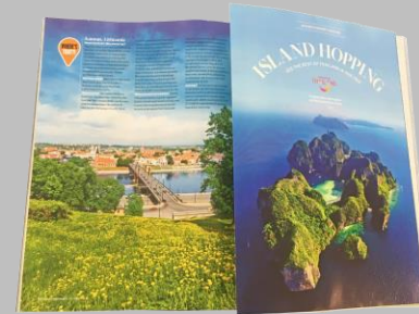
4pp gatefold advertorial throwout