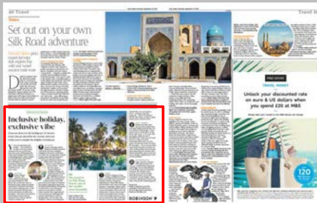
Times advertorial example