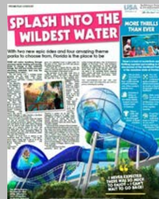
Sun advertorial example